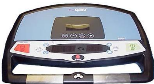
OLDER Color design S/N <T10-