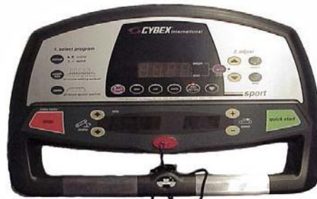
NEW Color design S/N T10-01XXXXXXX >